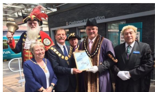
Some of the Shrewsbury town council delegation complete with town crier greeting the train on its arrival.