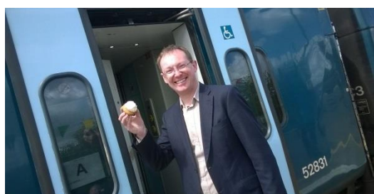
Russel George AM for Montgomeryshire grabs a commemorative cupcake at Welshpool